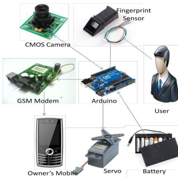
1.2 General Architecture

If the user who tries to enter the door is found as unauthorized and if the validation fails, the Arduino will start the camera and the image obtained from the camera will be sent to the owner's mobile through the GSM Modem. The GSM Modem has a SIM which is used to send multimedia message more like a normal mobile phone.